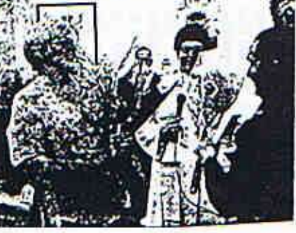
(Please turn to back p.